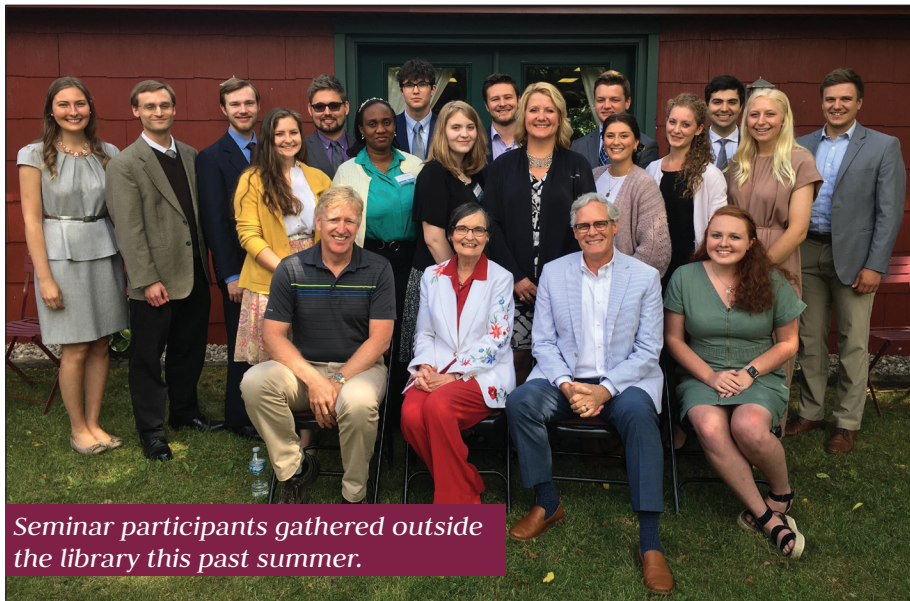
Seminar participants gathered outside the library this past summer.